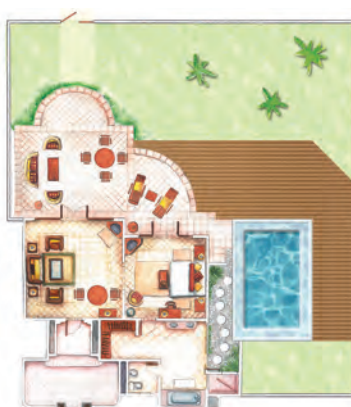
Beach Villa with pool