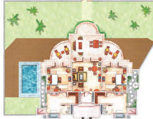
Senior Beach Villa with pool