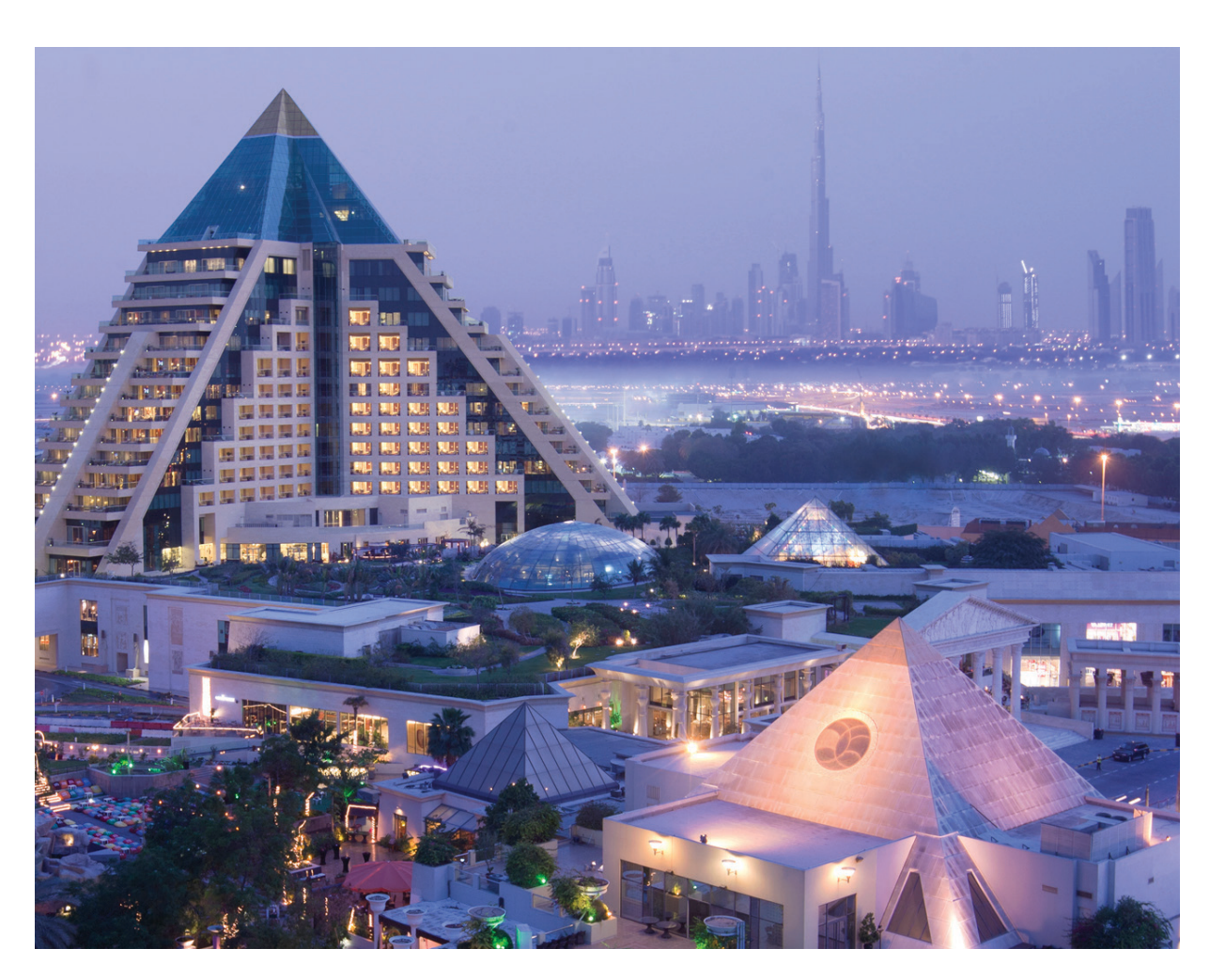
Your Residence - Your Raffles