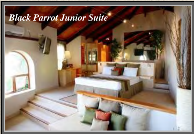
Black Parrot Junior Suite