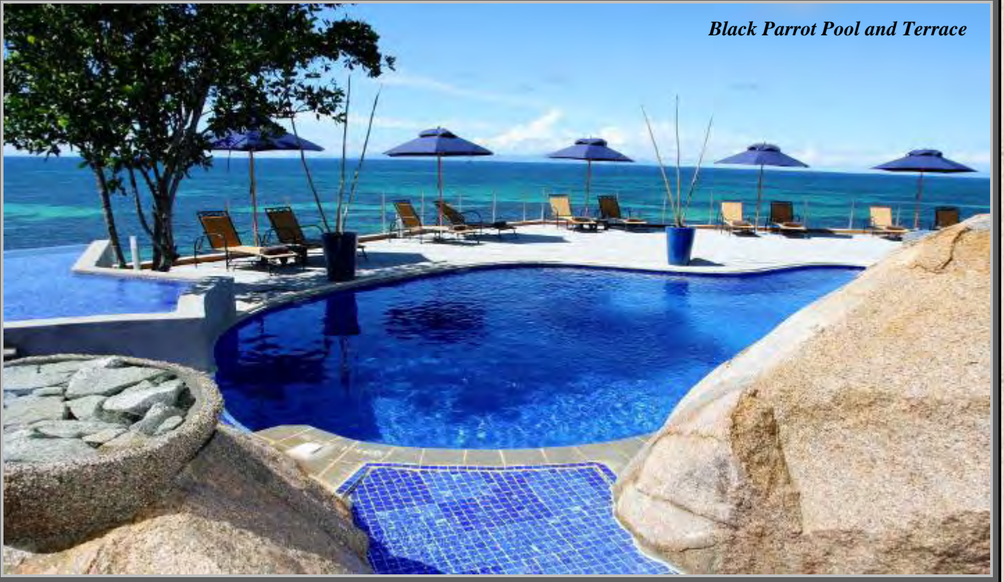
Black Parrot Pool and Terrace