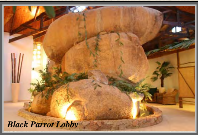
Black Parrot Lobby