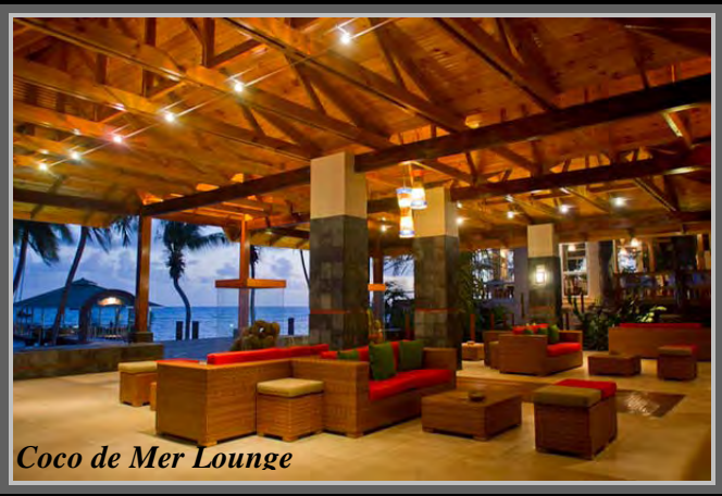
Coco de Mer Lounge