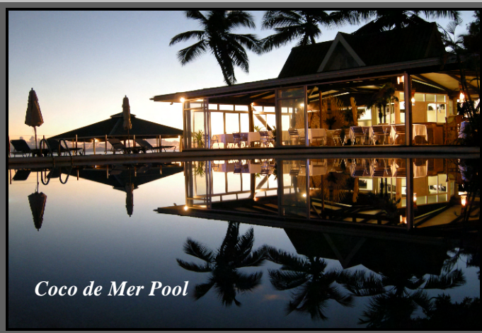
Coco de Mer Pool